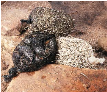
DelPore meltblown nonwovens are utilized for environmental clean-up, filtration and as sound barrier components.